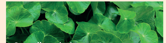
Centella asiatica extract