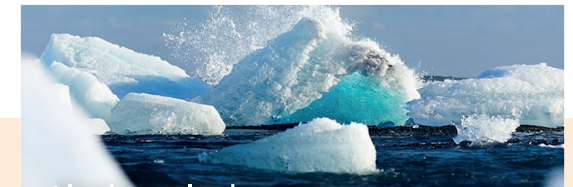
Alaskan glacier water

* Description applies to raw ingredients only